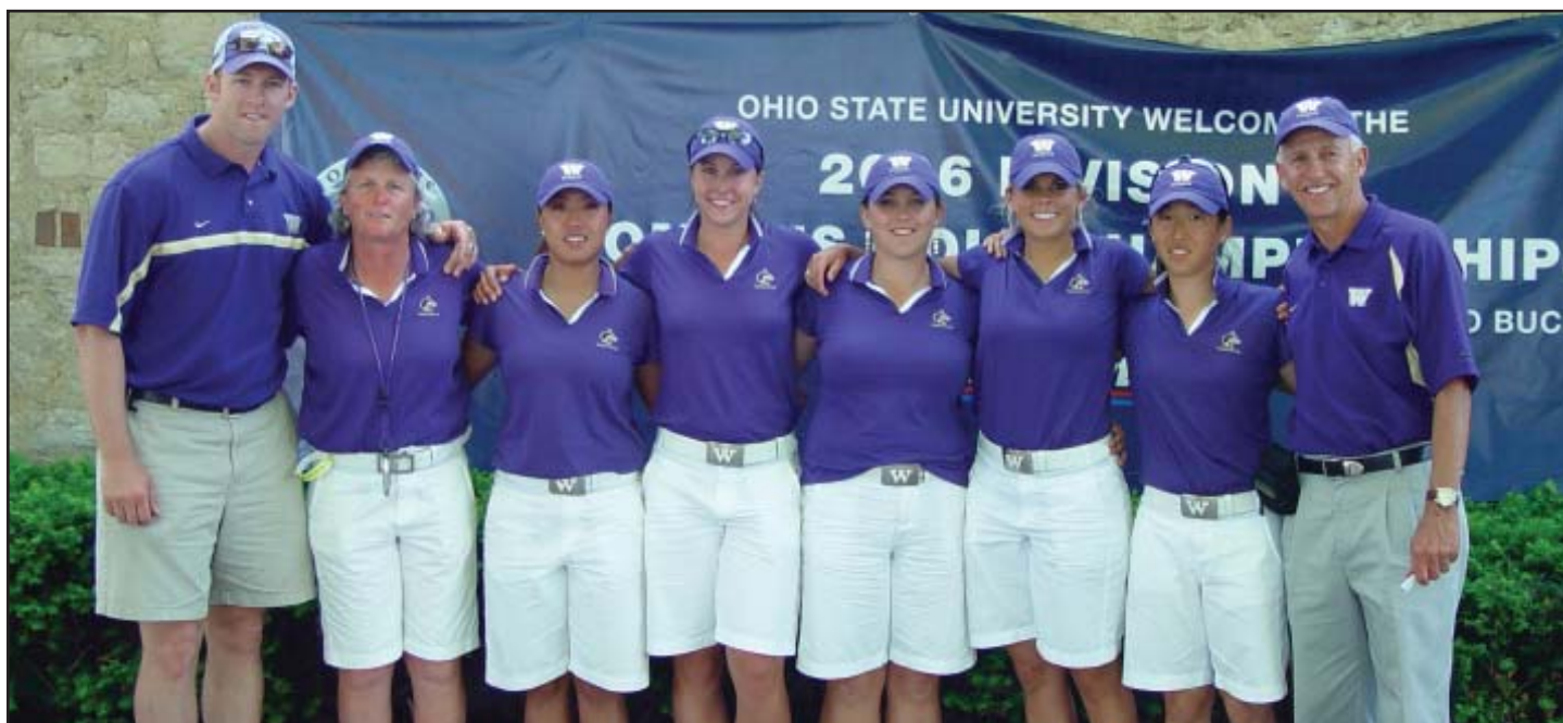
The 2006 Huskies finished sixth at the NCAA championship, equaling the best finish ever in UW history.